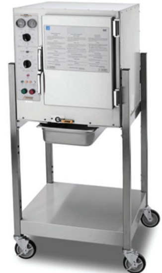
S6 Stand Mounted Steam'N'Hold™ Steam Cooker with optional 4" drain pan